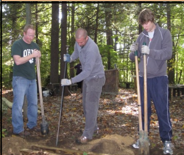
The Young Alumni Volunteers Constructed These New Benches at Curly's Chapel